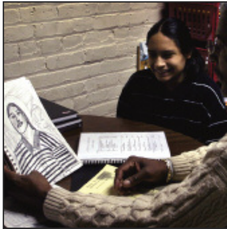
This page Sitar Arts Center